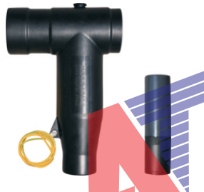
Type: AQT3-15/630K/□ (前接头 Front connector)

屏蔽型前/后接头用于电缆分支箱、环网柜、箱变等，保证了该产品可实现多分支供电。用于 \Phi 46/\Phi 56/91.5/M16 套管全密封连接，用于8.7/15kV、12/20kV交联电缆，适用电缆截面25~400mm 2 。